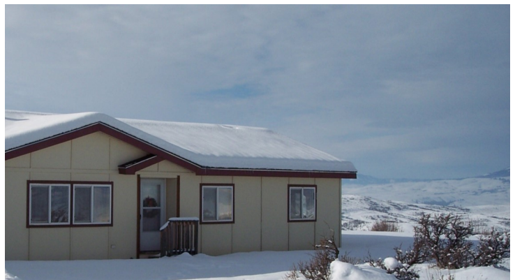
Holy Family House where I live next to chapel. The double windows show the living room/oratory where I spend much of the day in prayer and spiritual reading. The Christmas wreath is still on the front door.

January 5, 2024: This day I felt well enough to drive as far as Payette; then Weiser friends met me there for her to drive me and my car to Marymount. They unpacked the car for me and, though I was exhausted, it felt so good to be home after such a long time away. A Mesa neighbor bought fresh groceries for me in Council and so I was settled into my own nest. Ahhhh.